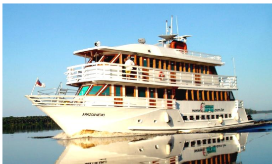
The Amazon Nemo cruising on a northern Brazilian Amazon tributary.

The Amazon Nemo is a 75-foot long, first-class fishing yacht that has quickly emerged as one of the most sought after peacock bass operations in Brazil. Although it is Brazilian owned, it was built to suit the needs of the American angler, having ample sized staterooms and bunk-beds that will accommodate tall American clients. Three varieties of peacock bass