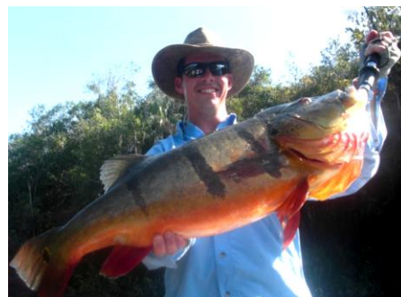
Trophy peacock bass are a definite possibility on just about any day of fishing with the Amazon Nemo operation. Offering a bi-lingual trip host/world-class angler, some of the most experienced guides in the Amazon watershed and comfortable accommodations, the Amazon Nemo provides the perfect base of operations for your week-long peacock bass excursion to Brazil. The results, at right, are typical of what you might expect to catch during your trip.

The Amazon Nemo is a 75-foot long, first-class fishing yacht that has quickly emerged as one of the most sought after peacock bass operations in Brazil. Although it is Brazilian owned, it was built to suit the needs of the American angler, having ample sized staterooms and bunk-beds that will accommodate tall American clients. Three varieties of peacock bass