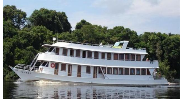
Yacht Tayacu on the Urubaxi River of Brazil

While you might not find this operation featured during an ESPN Outdoors fishing program or, perhaps, within the pages of your favorite fishing publication, an ever-increasing number of American anglers have secretly kept information about